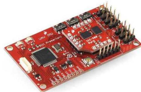
Figure 1. UAV Development Board v3

The used navigation and stabilization system is the result of an open-source project which created the hardware and the firmware also. The airplane equipped with the UAV Development Board (UDB) hardware (Figure 3.) which consists of a [5] dsPIC30F4011 controller, an MMA7260 three axis accelerometer and two dual axis IXZ500 gyroscopes, thus it can be a three axis IMU (MatrixPilot, 2011). With some input/output ports, it can be a 'bridge' between the RC receiver and the servos, and provide connections with other devices, such as GPS and XBee telemetry units or a small onboard data logger (OpenLog). The compact design is its main advantage, while this board is the smallest among the discussed hardware and it consists all necessary electric components to function as an inertial measurement – controller unit and this is also the cheapest one. The board is designed by William Premerlani (MatrixPilot, 2011). The physical dimensions of the unit are equal to 70×38×25 mm and the weight is only 16 g, thus it is very easy to build into model airplanes.