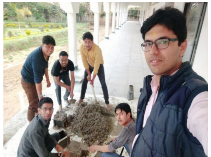
Fig.7 Picture showing casting of concrete work.