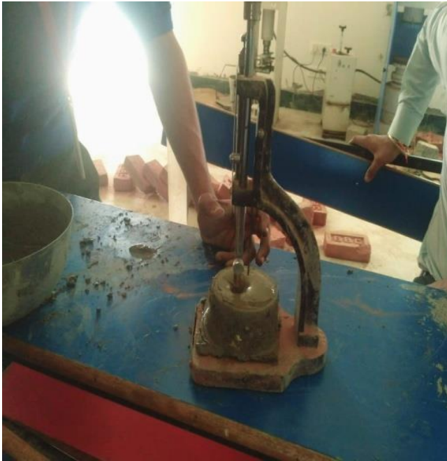
Fig1. Lab work of Consistency of cement

Raw Fiber:- Procured from Coconut Mattress Manufacturing Unit.