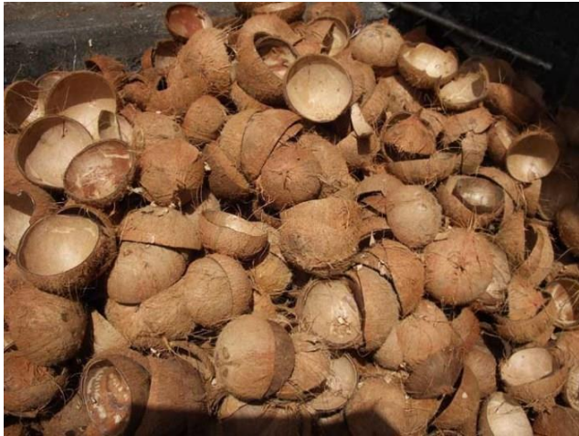
Fig.4 Picture of coconut shell as a coarse aggregate.

Coconut Shell:- Normal Indian Coconut. They are sun dried before being crushed. Particle size range from 12mm to 20mm. The surface texture of shell was fairly smooth on concave face and rough on convex face.