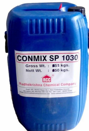
Fig.6 Picture of admixture used.