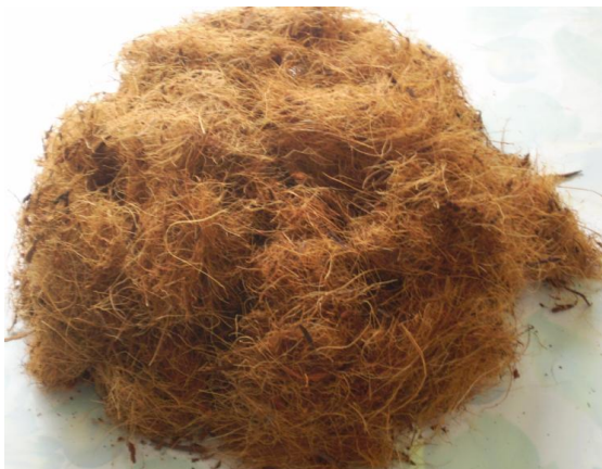
Fig.2 Picture of coconut fiber.