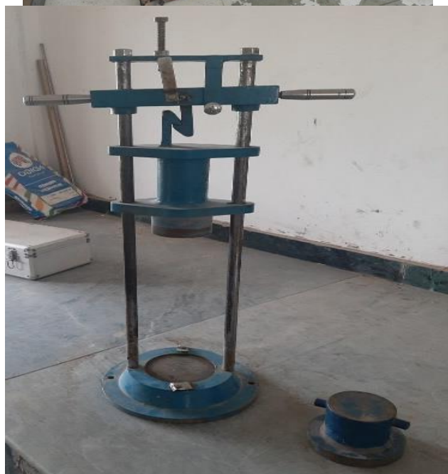
Fig.5 showing coarse aggregate lab work