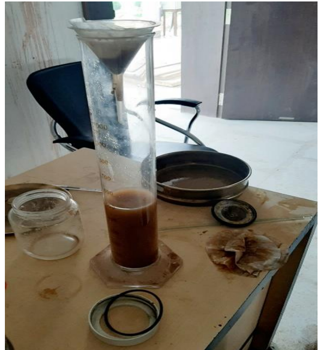
Fig.3 Picture showing fine aggregate lab work.

Processed Fiber:- Collected from Rope manufacturing unit.